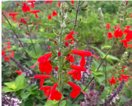
Tx Hummingbird Sage